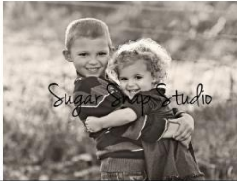
Photo Album Competition: A memorable snap from your family album with your brother/sister and add a wonderful caption to it. These will be presented in class and the best will be judged.